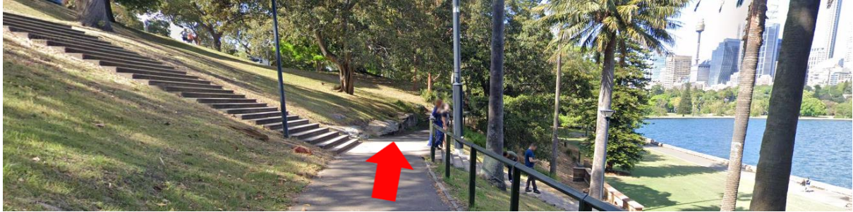
Continue along the middle path