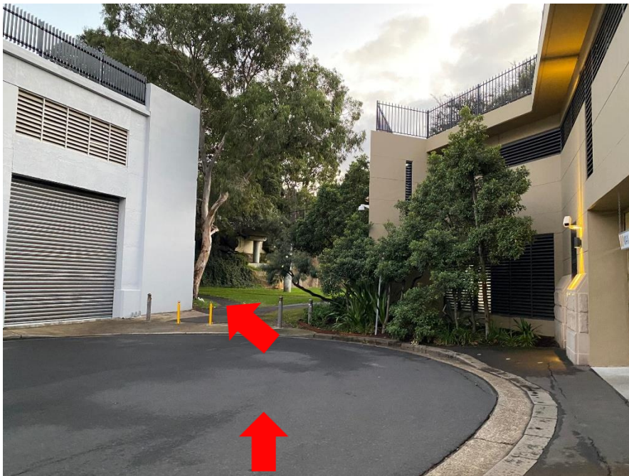
Turn left to return back up the stairs