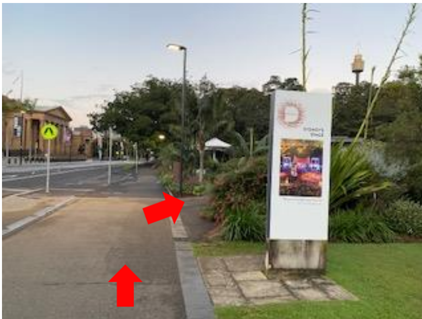
Turn right down path just before the restaurant