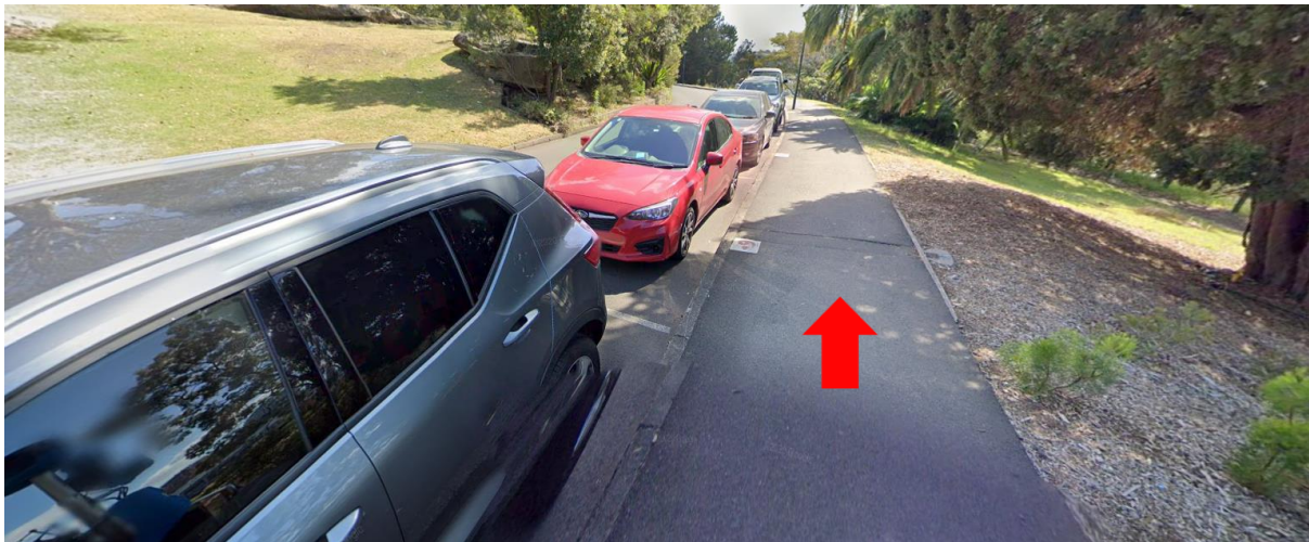
Continue along footpath