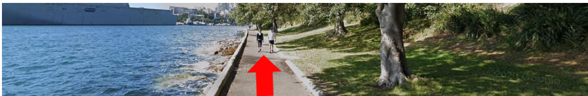
Continue along the foreshore path