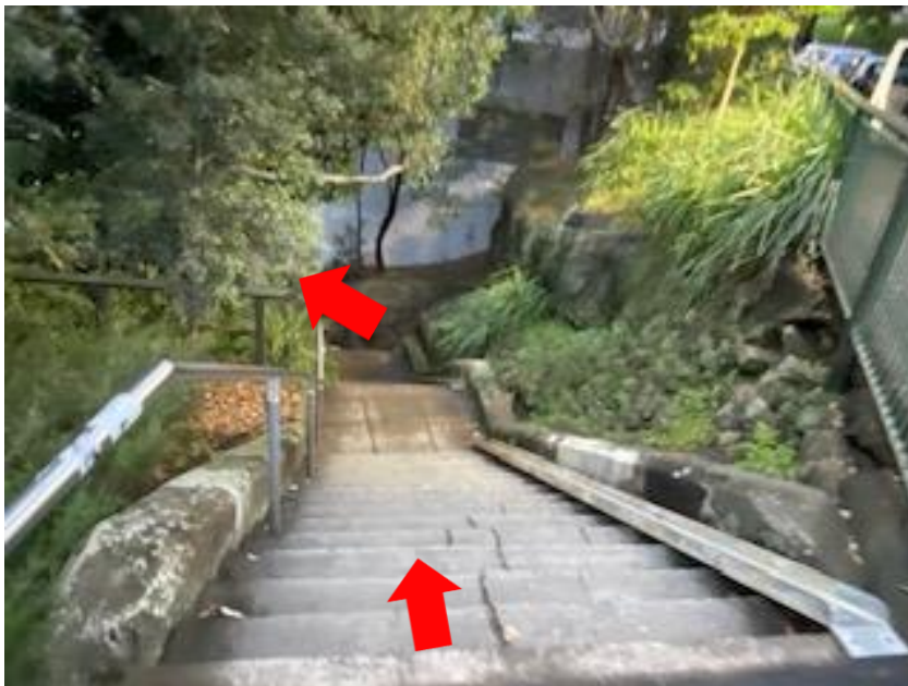
Down the stairs