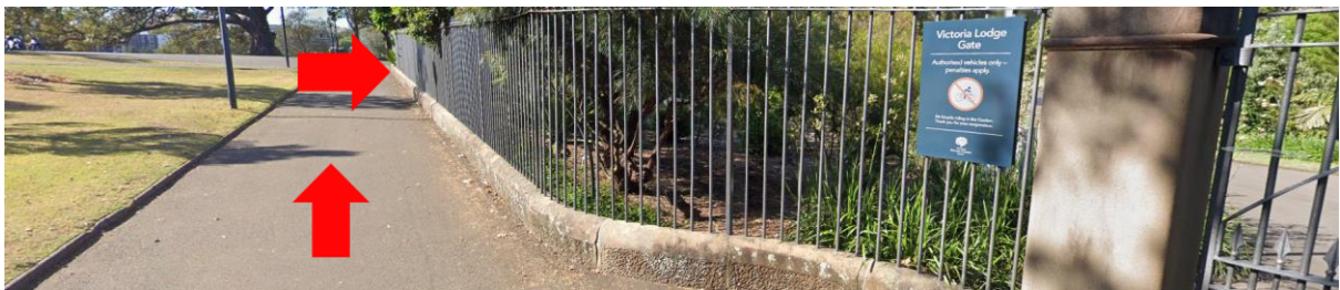
After 50m turn right onto footpath along Mrs Macquarie's Road