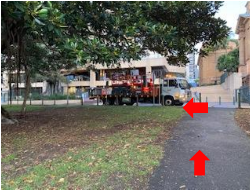
Turn left at end of path