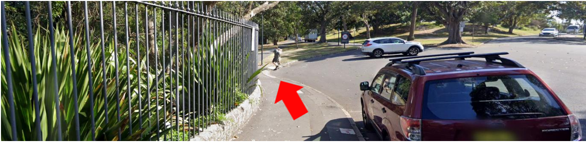
Turn left at end of railings downhill towards Farm Cove