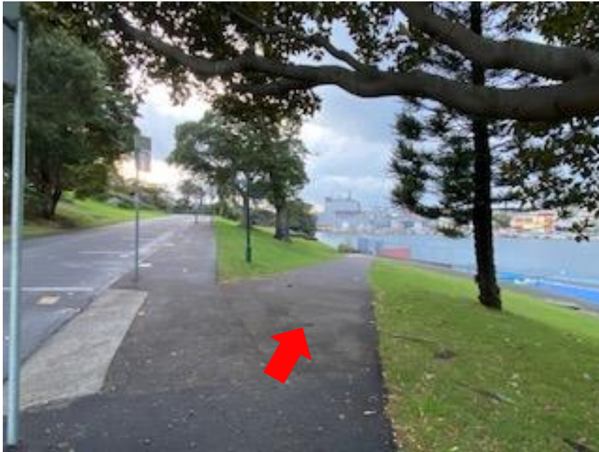
Showing path back to foreshore at end of Boy Charlton Pool