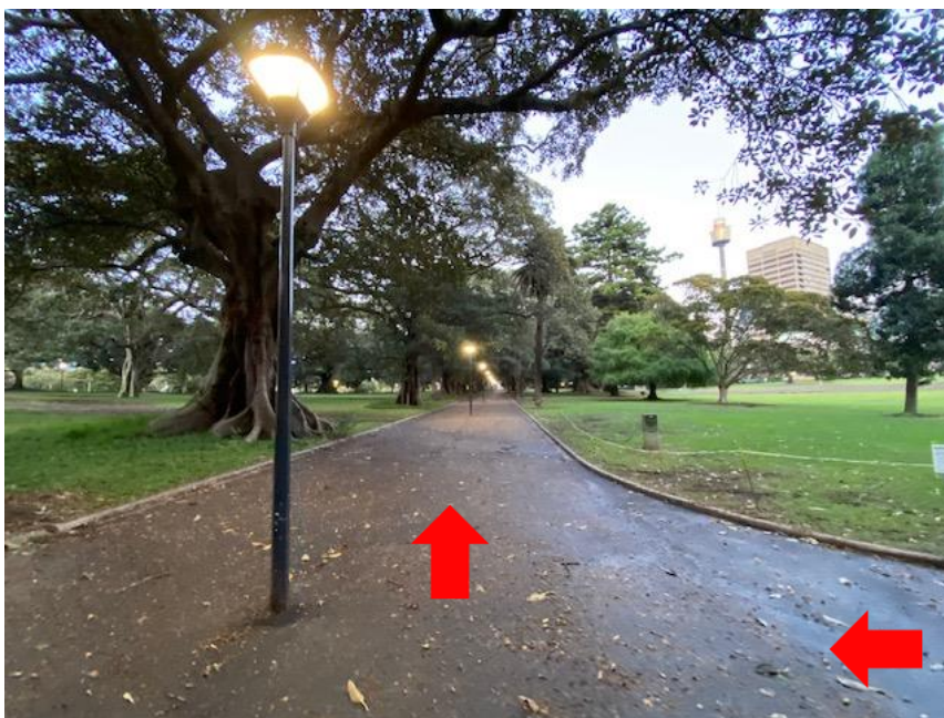
Turn right onto Central Avenue towards finish line