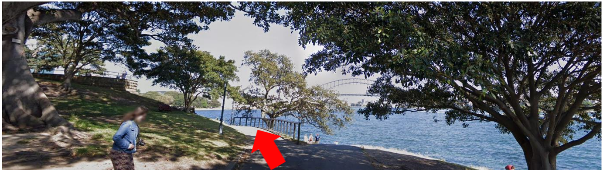
At Mrs Macquarie's Point take left fork back along 'middle path'