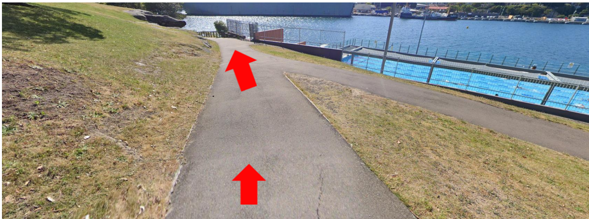
Showing path back to foreshore at end of Boy Charlton Pool