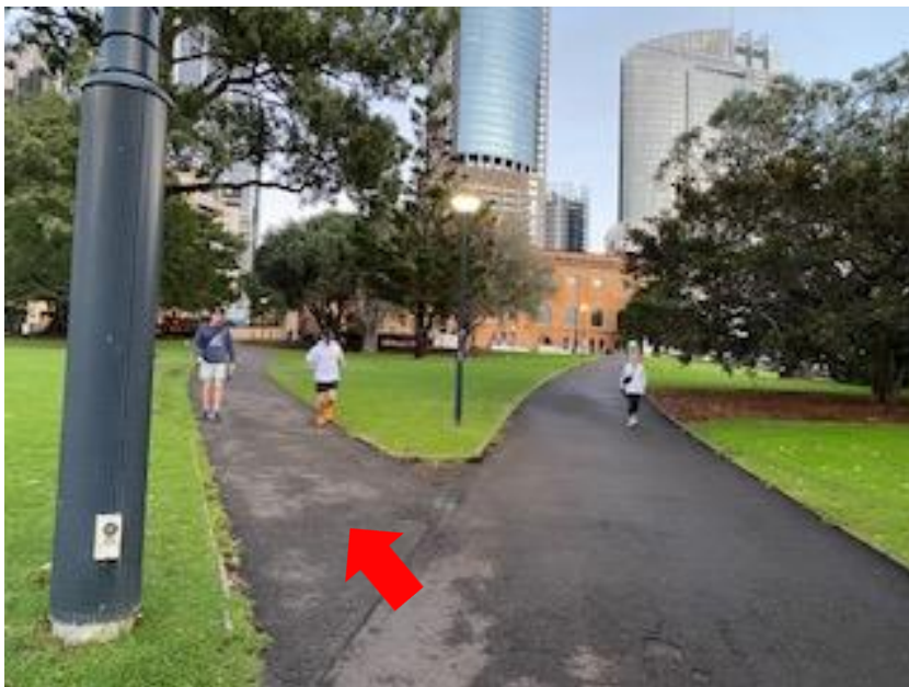
Veer left at path intersection