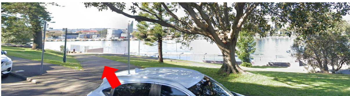
Take path (veer right) back to foreshore at end of Boy Charlton Pool