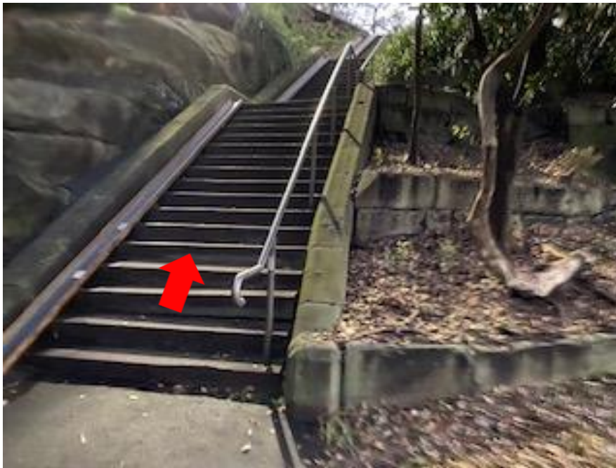
Back up the stairs