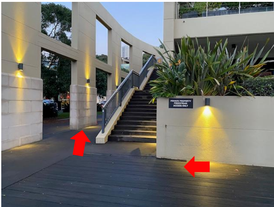
Follow around the apartment building