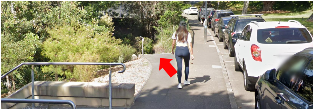
Left down stairs