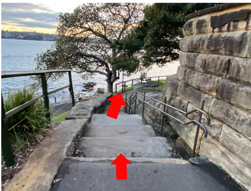
Down the steps at end of middle path, and follow path to the right