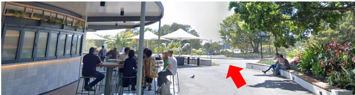
Turn left onto footpath along Art Gallery Road