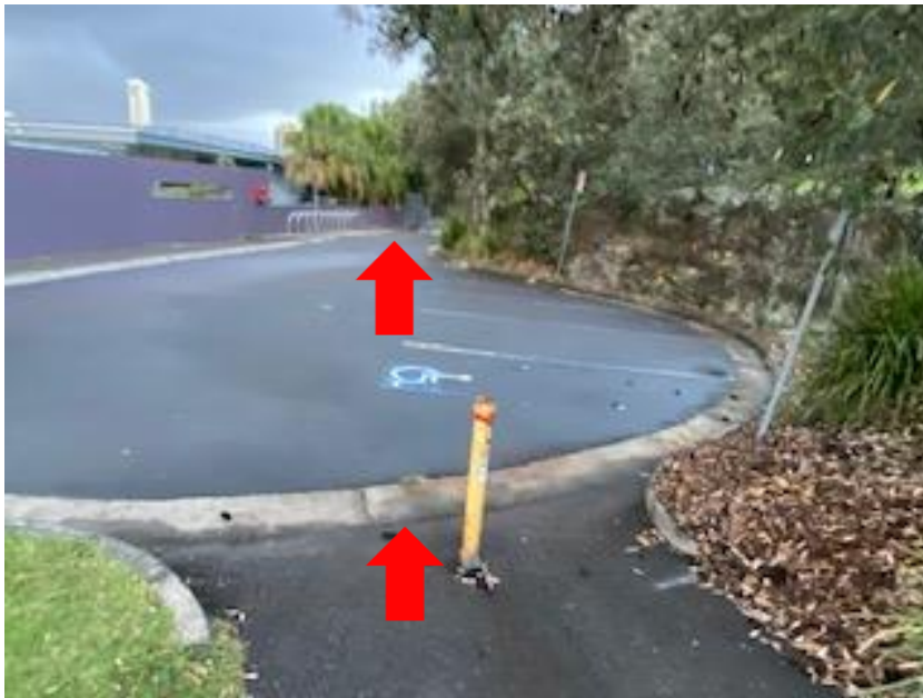
Continue past the pool