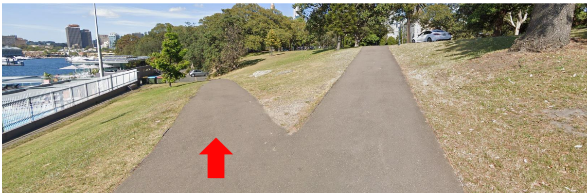
After small rise, keep left towards Boy Charlton Pool