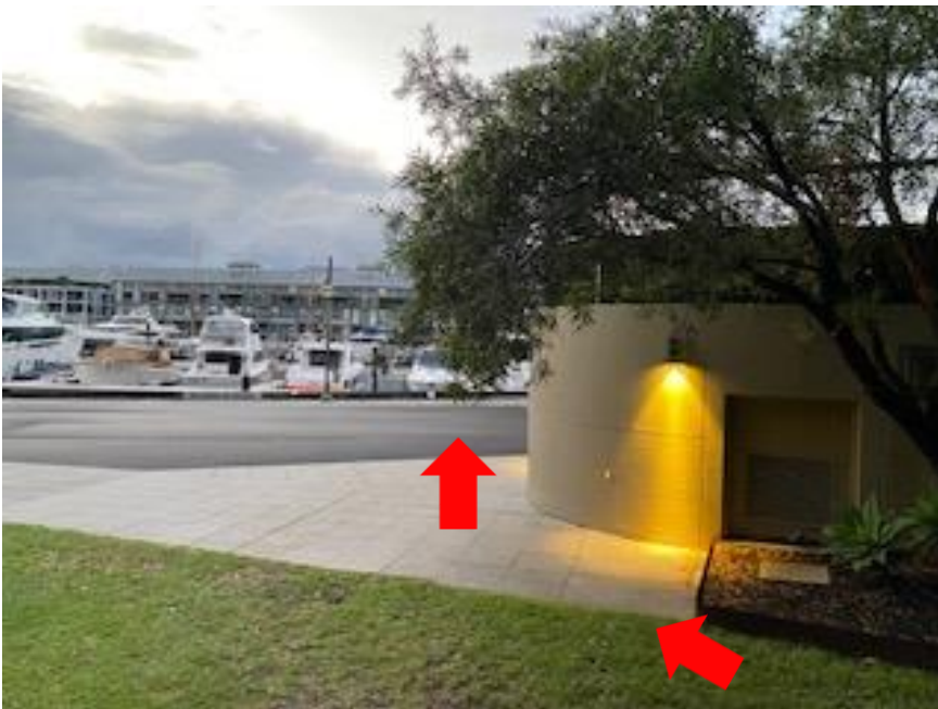
Clockwise around apartment building