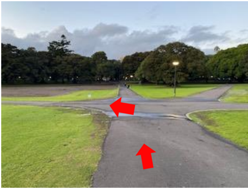
Turn left at first junction