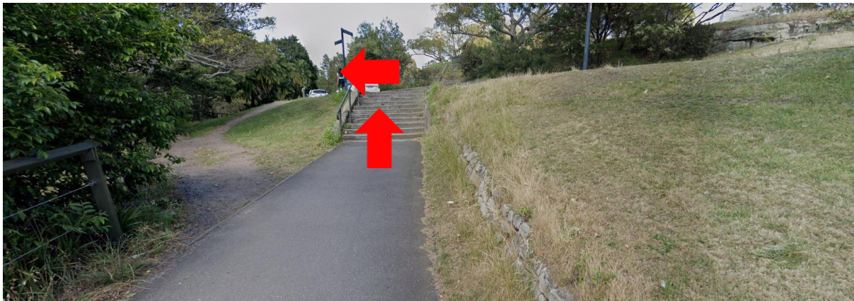
At end of path (up the stairs) and turn left onto footpath along Mrs Macquarie's Road