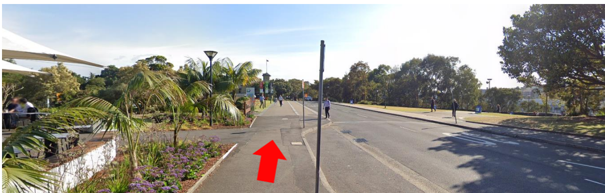
Straight ahead on Art Gallery Road (which becomes Mrs Macquarie's Road)