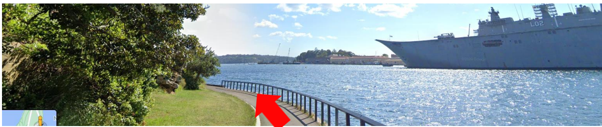
Stay on path