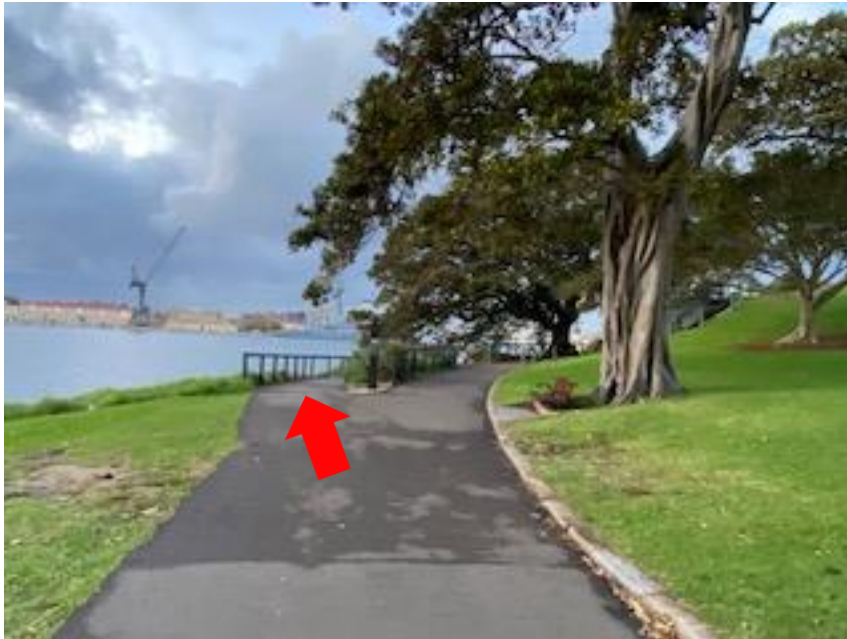
Keep left and continue along the foreshore path