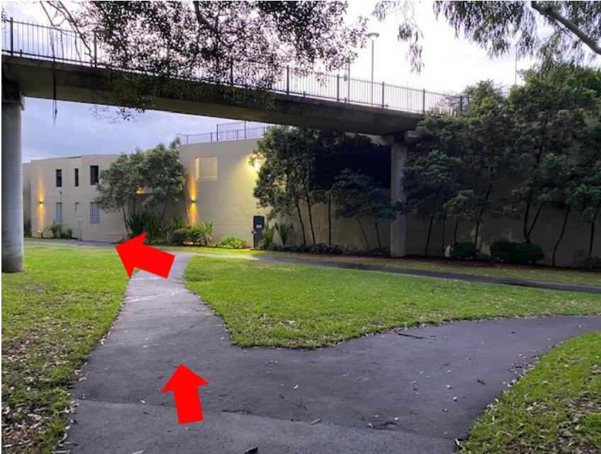
Keep left (clockwise around apartment building)