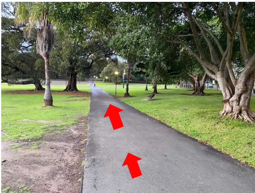
Turn left onto downhill path