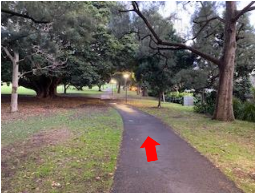
Follow path straight