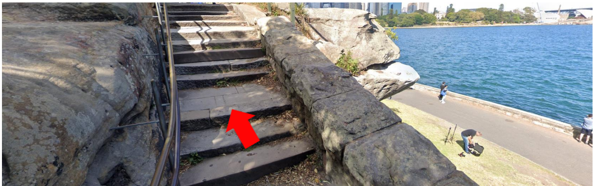
Continue along the middle path up the stairs