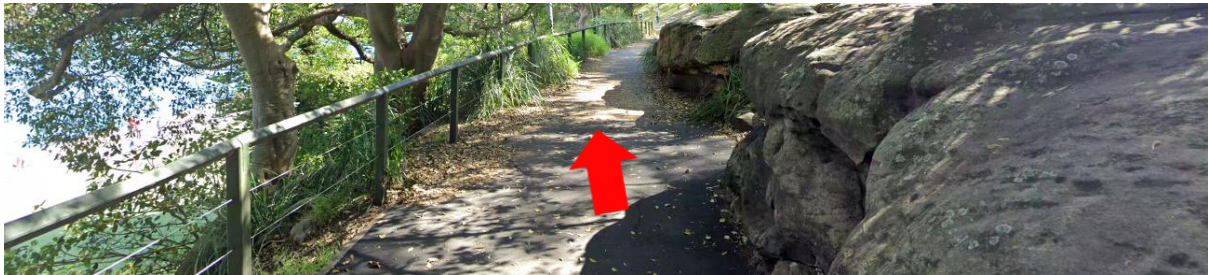
Continue along middle path