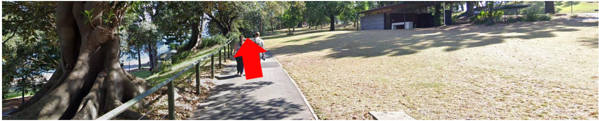
Continue along middle path