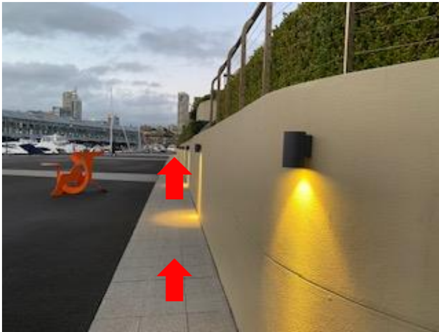
Follow around the apartment building