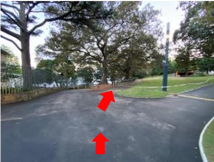
After 50m turn right onto 'middle path'