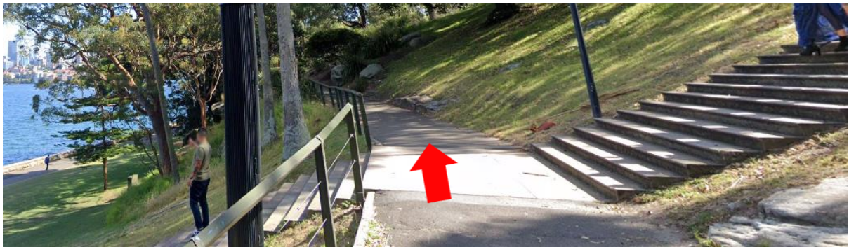
Continue along middle path