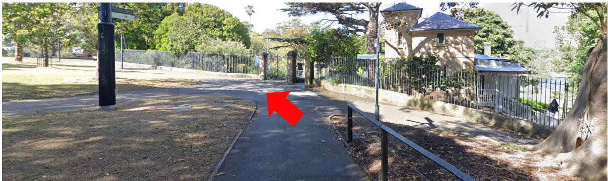
Turn left at the end of the middle path