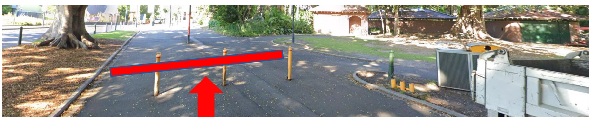
Finish line – ensure that chip beeps when crossing the finish line