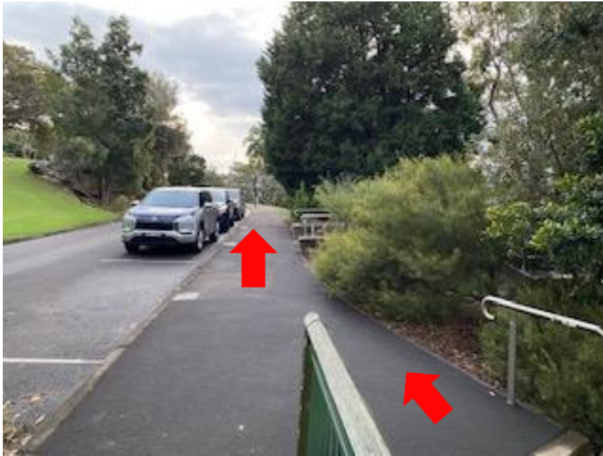
Showing footpath along Mrs Macquarie's Road