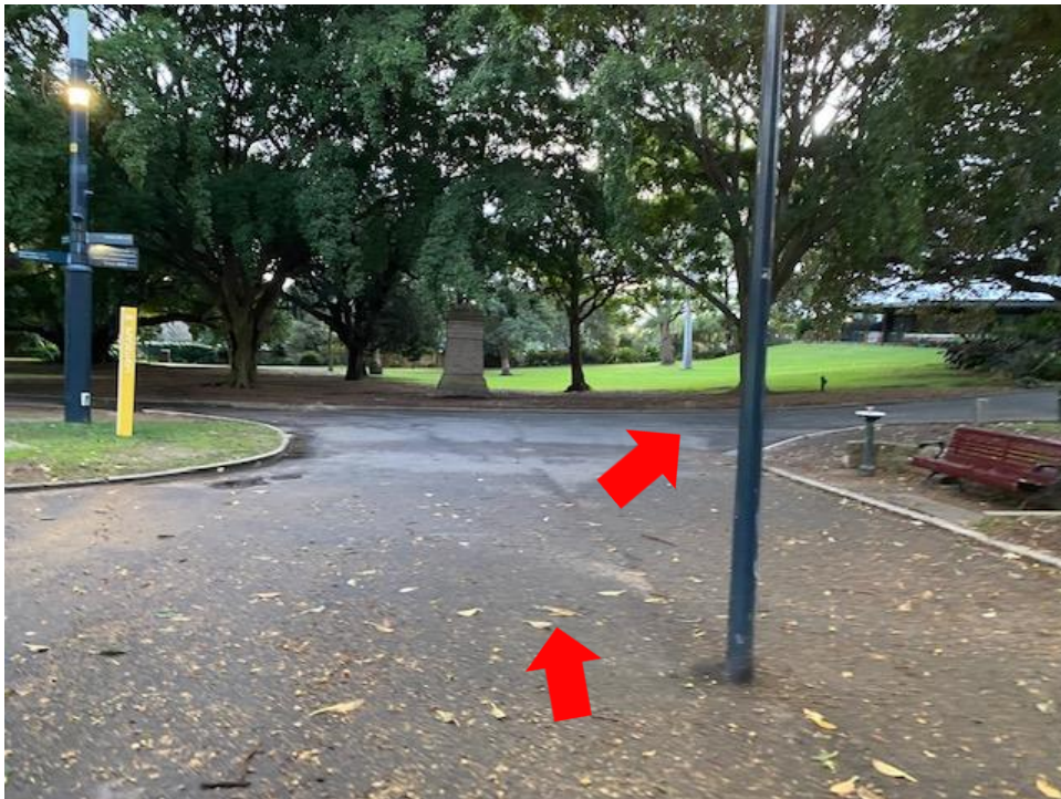
At end of Central Avenue turn right

Listen for chip to beep across start line (time won't be recorded if no beep)