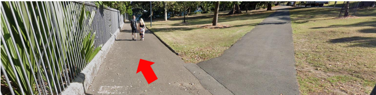
Showing path downhill towards Farm Cove