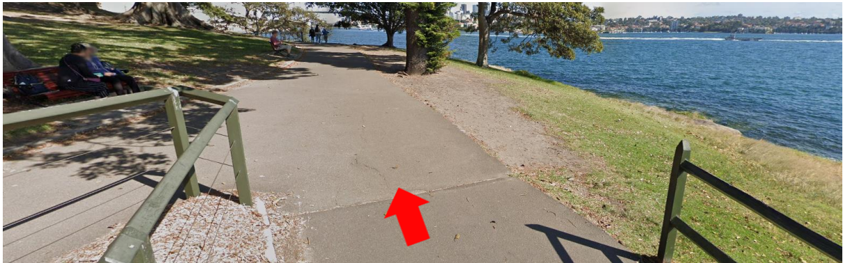
Continue along path