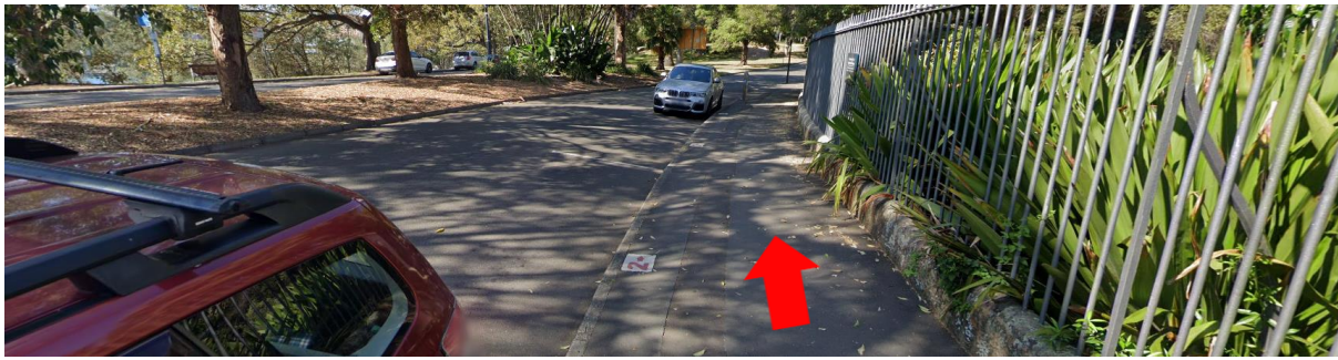
Continue along footpath along Mrs Macquarie's Road