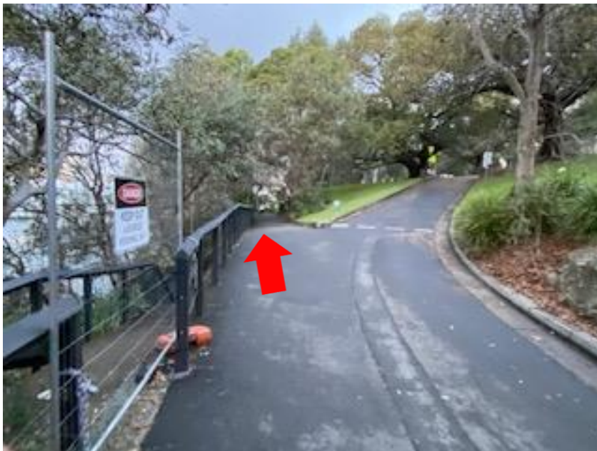
Keep left along the water's edge